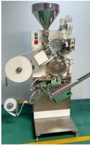
Automatic High speed Tea Bag With Paper Crimping Outer Pouch